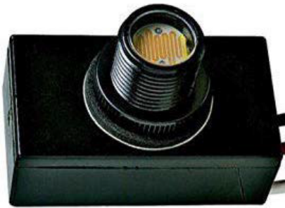
Button Type Photocell